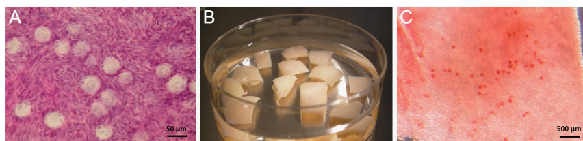
Figure 3 (A) A fresh ovarian biopsy. PAS-stained human ovarian cortex showing early-stage resting follicles located within the tissue. (B) Thawed pieces of human ovarian cortex ( 5 \times 5 \times 1-2 mm). (C) Viability assessment. Frozen-thawed human ovarian cortical tissue stained with neutral red for 3–4 h in situ . Red stained viable follicles are located within the tissue.

demonstrated that the majority of follicles survive the slow freeze procedure. In addition, the survival rate of follicles that had been stored in liquid nitrogen for up to 17 years was similar to that stored for tissue stored for just a few years. Currently, no study of slow freezing and vitrification compares follicle survival while using the new neutral red staining method. Irrespective of the outcome of such a comparison, the follicle survival rate is so high that further improvements should focus on refining the transplantation techniques.